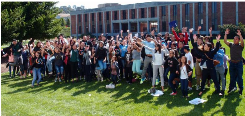
Participants of the APIASF Jump Start College Tour at CSUEB